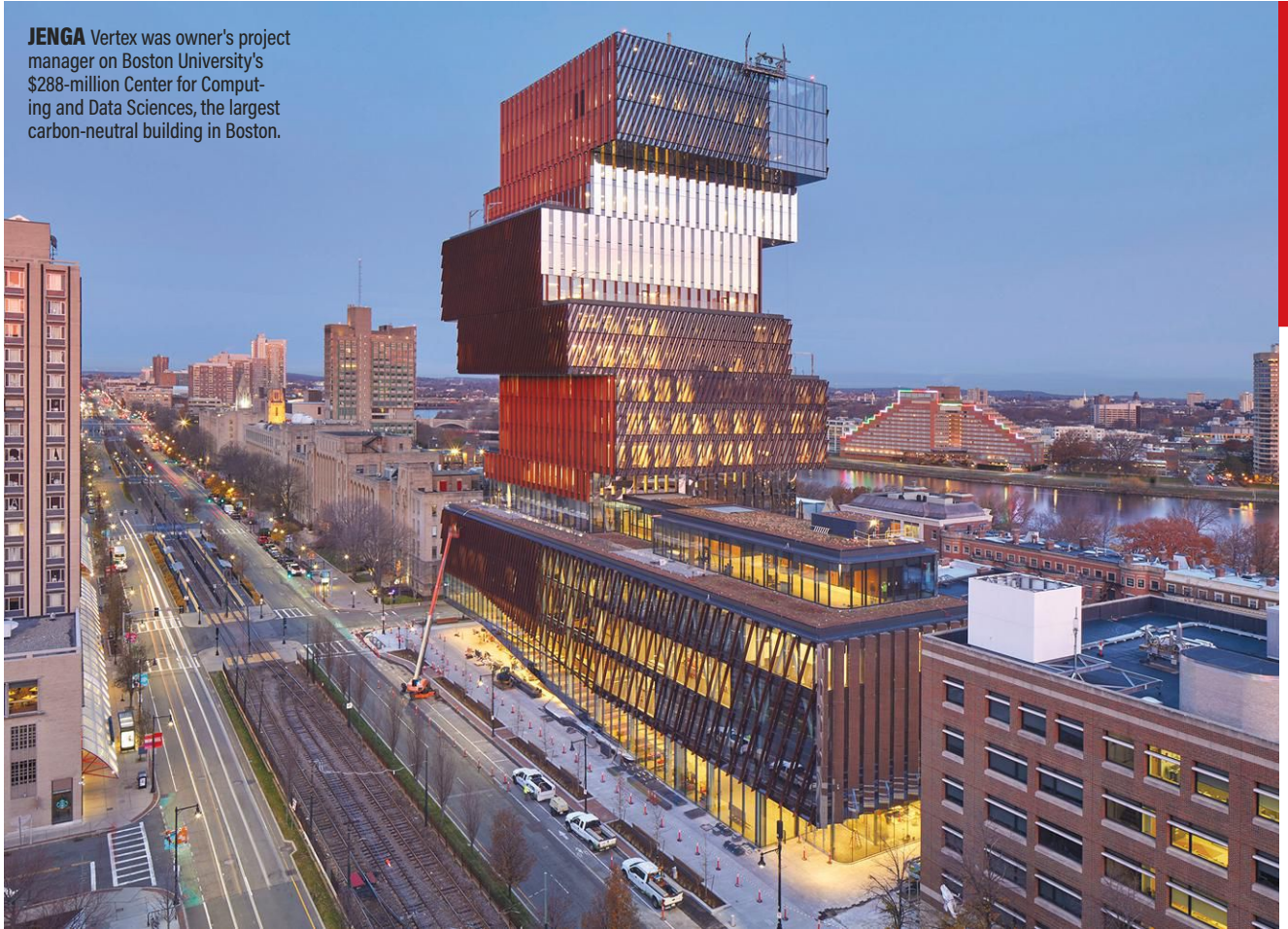
JENGA Vertex was owner's project manager on Boston University's $288-million Center for Computing and Data Sciences, the largest carbon-neutral building in Boston.

Overview p.34 // CM/PM-for-Fee Revenue p.34 // The Top 20 Firms in Combined Design and CM/PM-for-Fee Revenue p.35 The Top 20 Firms in Combined Industry Revenue p.35 // Revenue by Owner Type p.35 // The Top 50 Program Management Firms p.36 The Top 50 CM-for-Fee Management Firms p.37 // The Top 100 CM-for-Fee/Program Management Firms p.38