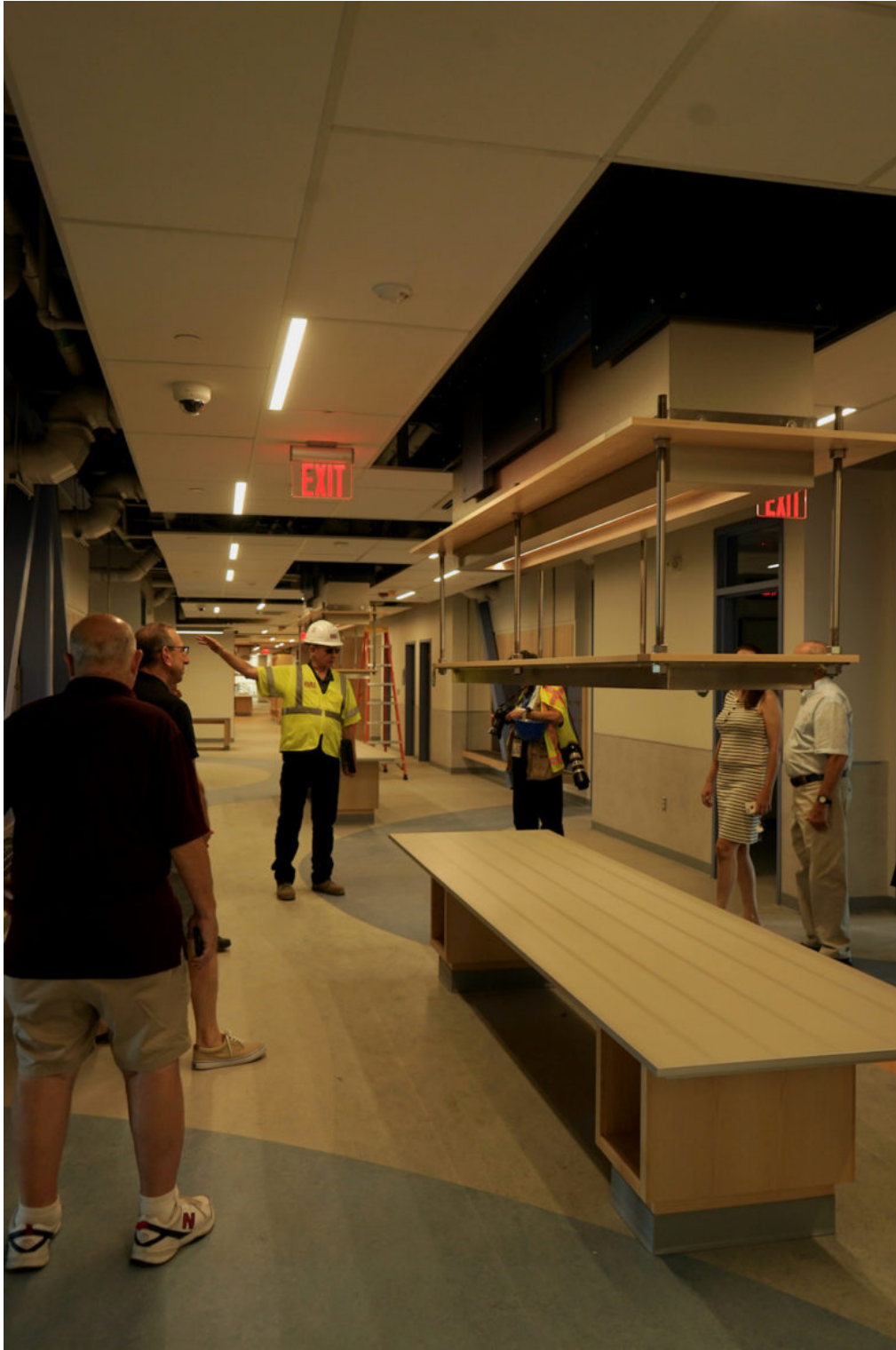
A table in the hallway at Cunniff Elementary School, where students will work on group projects.